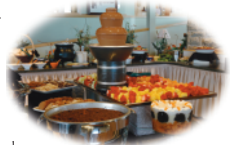
Desserts from our Chocolate Fountain